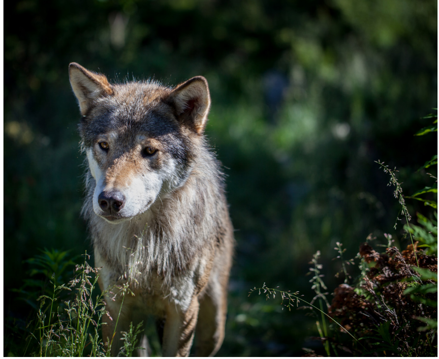
The Eurasian Wolf

And the part of the world that still has the biggest impact on the environment and the biggest historic responsibility, Europe, has an ambitious comprehensive set of policies in place that seek to reduce its ecological footprint, protect and restore its degraded ecosystems, move to a clean, efficient energy system. What's more, being the worlds' largest consumer market, the EU functions as a de-facto global standard setter. A role, incidentally, that it was prepared to give up during the negotiations with the US on TTIP.