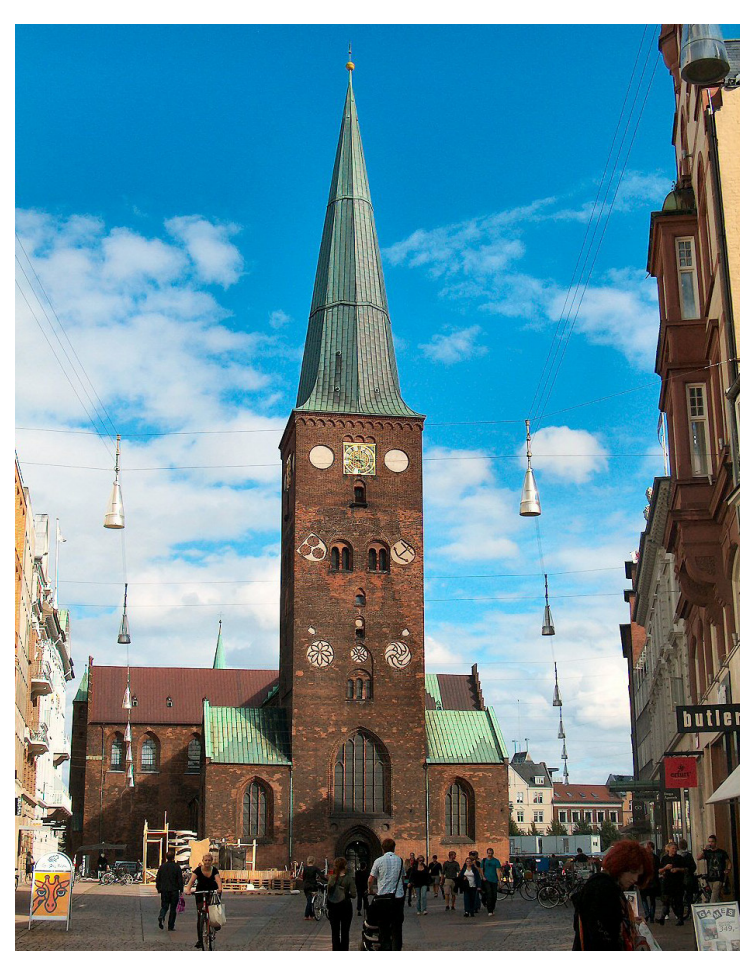
The Store Torv public square in the Danish city of Aarhus where the convention was adopted in 1998.

he European Union has been severely criticised for failing to accept UN findings that it is in breach of international law on environmental justice.