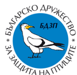
Bulgarian society for the protection of birds