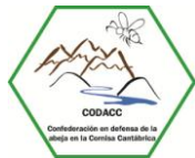
Confederación en Defensa de la Abeja en la Cornisa Cantábrica CODACC