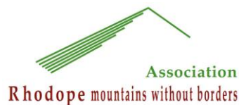
Rhodope mountains without borders