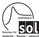
SOL – People for solidarity, ecology and lifestyle, Austria