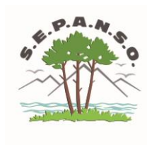
Federation SEPANSO Aquitaine