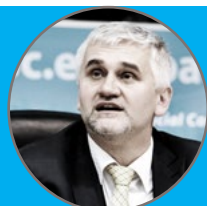
Jan Dusik, Director Regional Office for Europe, United Nations Environment Programme (UNEP)

In light of the current global political context, the SDGs are probably the best set of universal goals that we could get. There are still hurdles such as the threat to reduce full participation of civil society in the UN system, although we are hopeful that we will win this fight as many member states and the EU are on the side of civil society. Civil Society is ready to start work on monitoring the implementation, but is also waiting for a EU strategy and action plan to implement all the 17 goals in Europe.