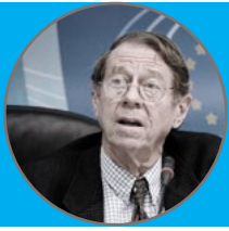
Arthur Dahl, President of the International Environment Forum, Co-Author of the GEO-6 Outlook Report ( click here for presentation)

Europe is in a privileged position to work on the SDGs: it can take the lead for other parts of the world because of its great experience in supra-national cooperation. But challenges remain, fine-tuning of the targets needs to happen and there are some obvious conflicts where choices need to be made. For example on Goal 15, about ecosystems and biodiversity: there are conflicts between that goal and agriculture and settlement patterns. Another example are the fisheries subsidies that create overfishing all over the world or target 12-c on harmful fossil fuel subsidies. We also need to retrain workers that are employed in unsustainable businesses.